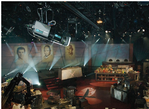
MicroPlus on RailRunner Iron Chef America

The computerized operating system allows pre-sets and ramps. The pre-sets are handy for setting start marks when operating in a very dark environment. The operator can control the dolly with a joystick or foot pedal control. With the ACE MicroPlus mounted on the dolly the height to the center of the lens is 12 inches from the floor. Track sections are anodized black, 6.6' pieces that can be easily mounted horizontally (on the floor, or at a right angle to the floor on a wall), vertically or overhead. The dolly is captured on the track and the track sections weigh only 26 lbs. so that virtually any mounting position can be easily attained. Two sleds are available; pictured is the 20" sled, also available is a 36" sled for larger heads. Both are anodized black. Horizontal dolly speeds of up to 15 feet per second are attainable with a load of 90 lbs., faster speeds are attainable with lower loads.