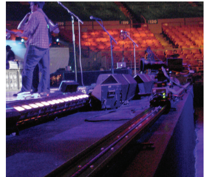
MicroPlus on RailRunner Dispatch: Zimbabwe - MSG